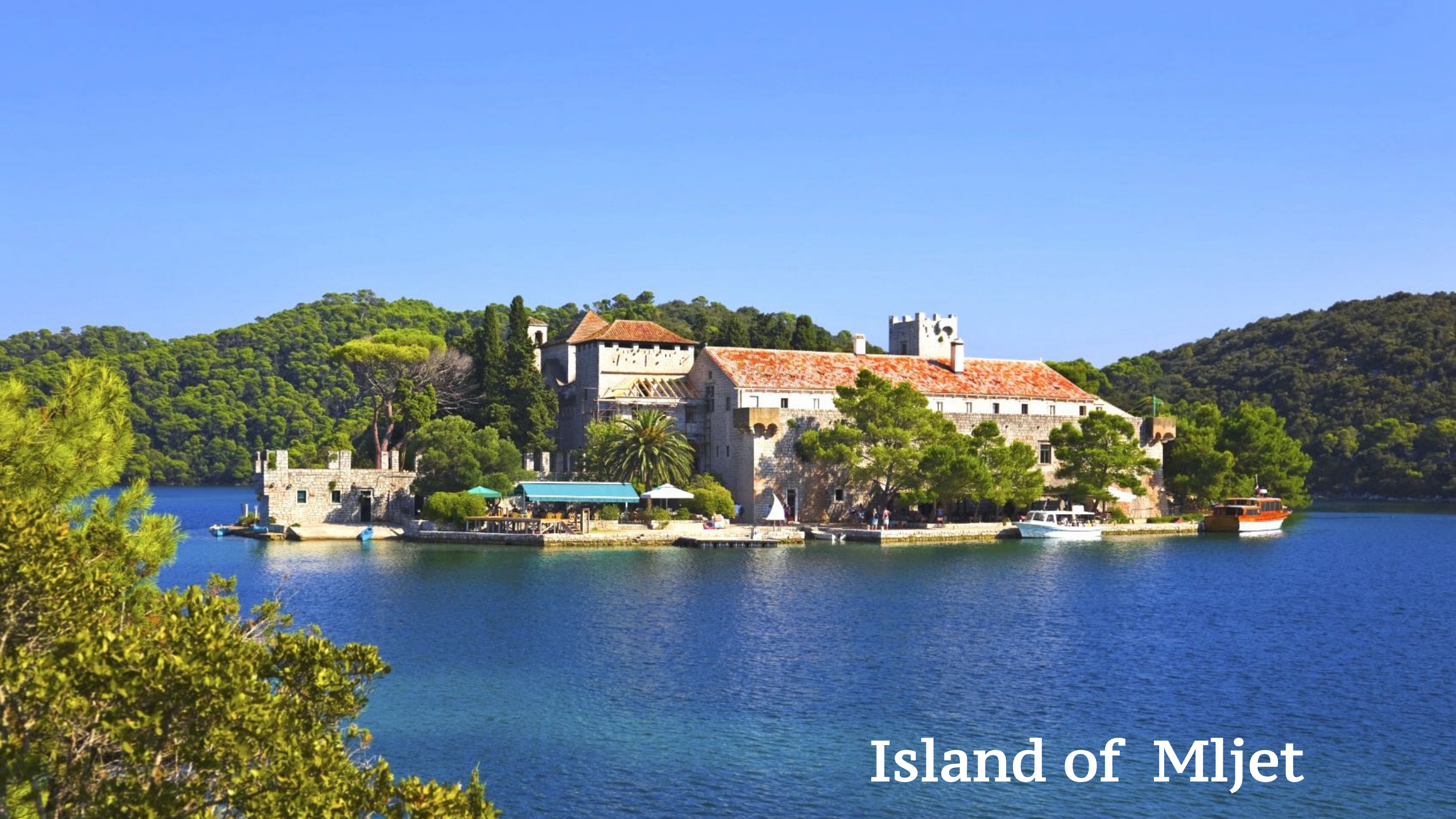
Island of Mljet